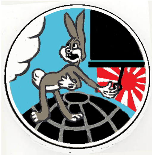
881 Bombardment Squadron, Very Heavy emblem

1 Tactical Missile Squadron emblem: On a shield Air Force blue, bordered White, outlined black, a rectangular checkerboard, palewise, red and White; overall an armored gauntlet, black, detail and highlights White, the cuff marked with a heart Air Force yellow; grasping a stylized missile, White, pointing to dexter chief, all bendwise; and in saltire with a lightning bolt, Air Force yellow, sinister bendwise. SIGNIFICANCE: The blue of the field of the shield and the golden yellow of the lightning bolt are the Air Force colors. The gauntlet signifies strength and guidance; the missile represents the mission and relates to the unit's pioneer work on many "firsts" in missile development and employment. The lightning bolt symbolizes the electronic nature of the mission. The red and White checkerboard portrays the unit's adopted colors. The shield identifies the unit with the wing. (Approved, 18 Jan 1957)